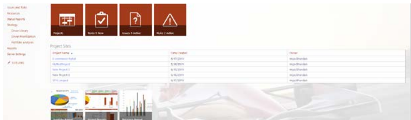
Figure: Dashboards and drill-down functions help to identify problems in the current portfolio.

Switching from decentralized processes to enterprise-wide, integrated project management is always a great challenge. This goes both for the company as a whole and for the individual staff members. To master this challenge, Hörmann Logistik had a clear strategy. “Our main aim was to take the first important step quickly and to establish a fully operational solution within a short period of time with the complete range of functions we required,” König reports.